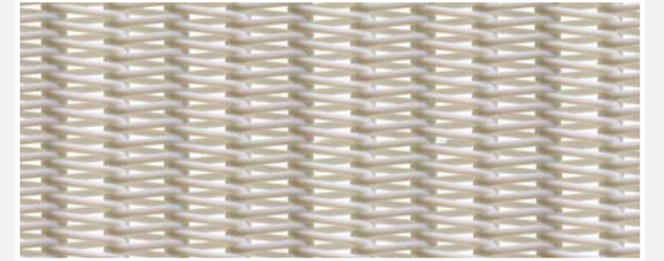
90000 S, 90000 H, 90000 T, 90000 T+, 90000 Q, 90000 L