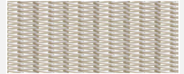
70000 S7L, 70000 H7L, 70000 T7L, 70000 T7L+, 70000 Q7L